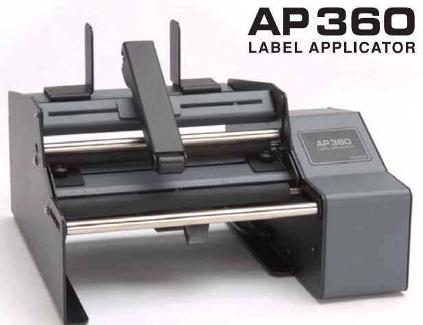
AP 360 LABEL APPLICATOR

With an AP-Series Label Applicator you'll apply labels faster and more accurately – helping to speed up your production and sell more of your products!