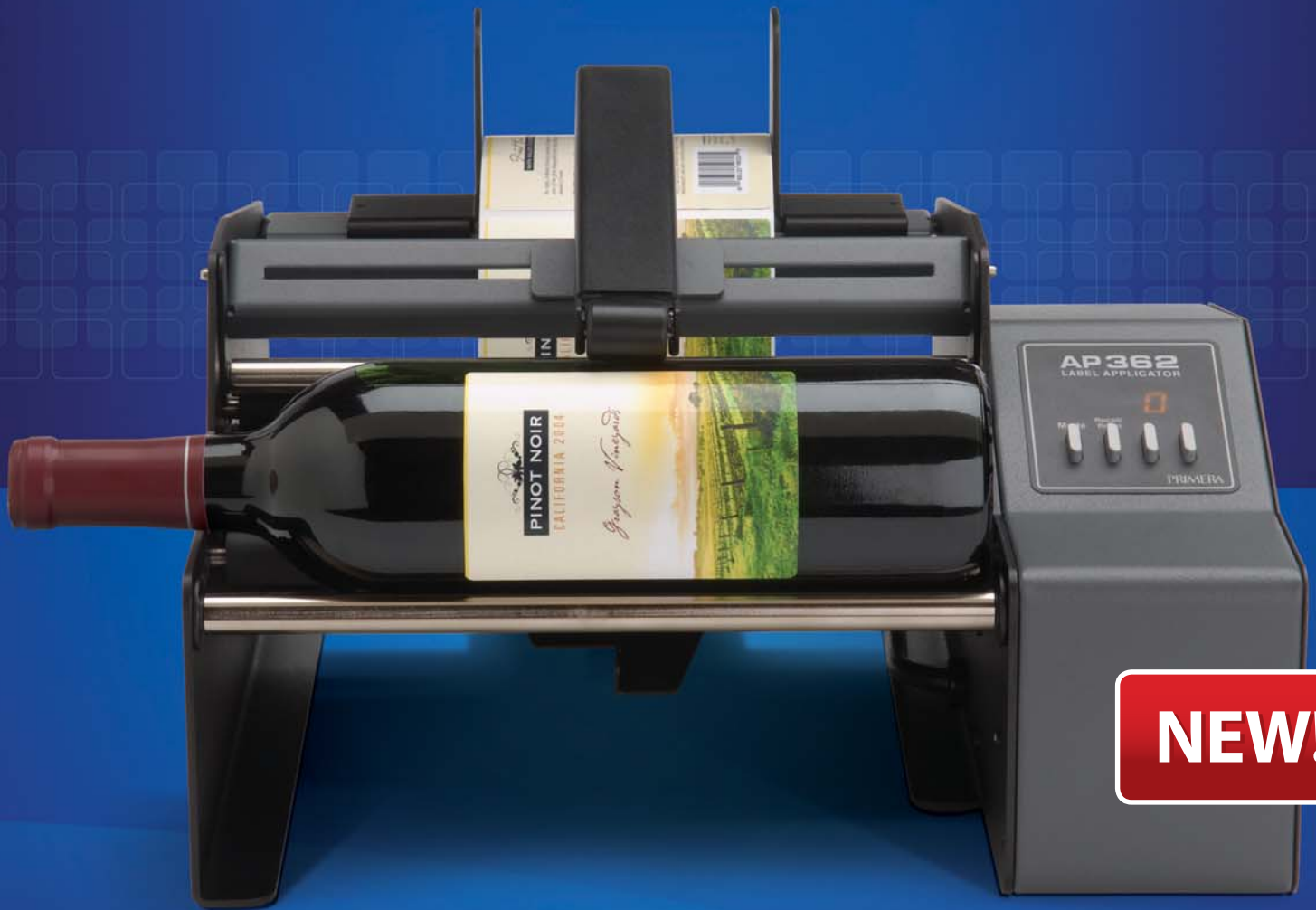
AP 362 LABEL APPLICATOR

Primera's AP-Series Label Applicators are the perfect semi-automatic labeling solution for cylindrical containers as well as many tapered containers, including bottles, cans, jars and tubes.